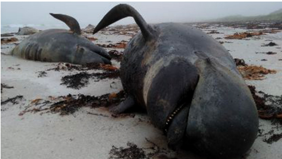
Pilot whales beached at Hansen Bay

This was a moment of sadness and a time to reflect as I watched their decaying bodies once again being reunited with the waters that once surrounded them in life.