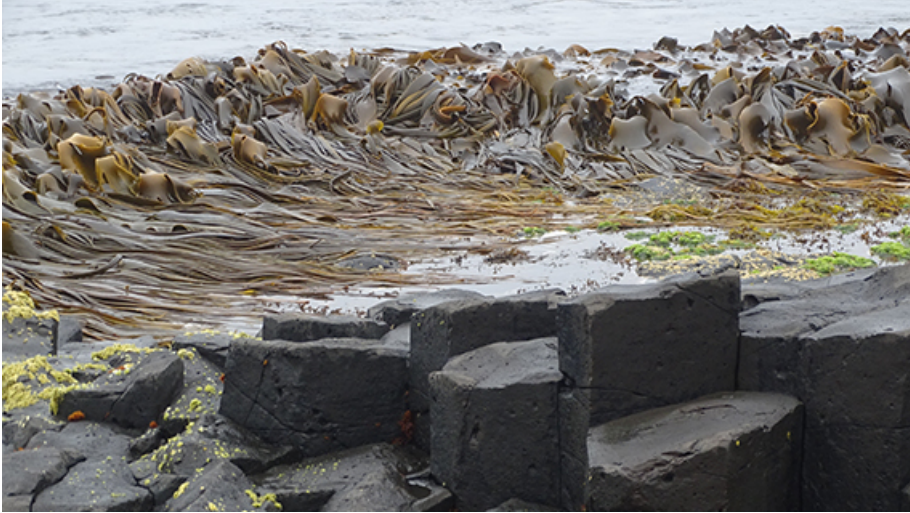
Basalt columns at Ohira Bay

The basalt columns of Ohira Bay that rise above the ground, every angle a photographer's delight.