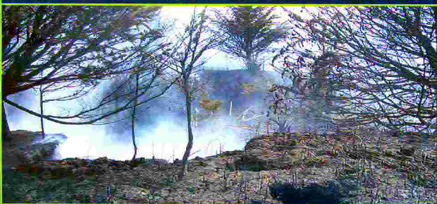
Rural fire at Owenga in 2006

Copies of the CDEM Group Plan are available at the Emergency Management Office, Chatham Islands Council building, during office hours.