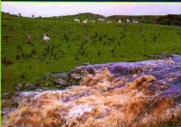
Flood caused by excessive rainfall at Owenga in 2005

The Civil Defence Emergency Management (CDEM) Group is responsible for the management of all hazards in a way that contributes to the social, economic, cultural and environmental well being, and safety of the public.